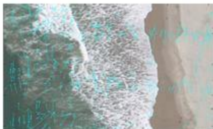
Fig 2. SIFT Detector

The proposed technique was applied to detect the boundaries in several types of images