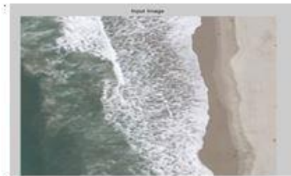
Fig 1 .Input image

Tests were performed on varied pictures. In every picture, feature regions square measure clearly visible. The applying of the rule was incontestable for various sets of pictures.